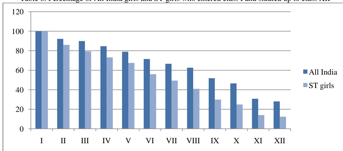
Table 6: Percentage of All India girls and ST girls who entered class I and studied up to class XII